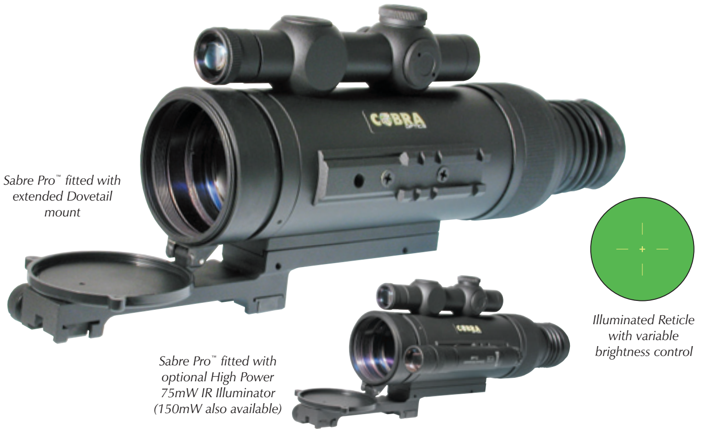
Sabre Pro™ fitted with extended Dovetail mount